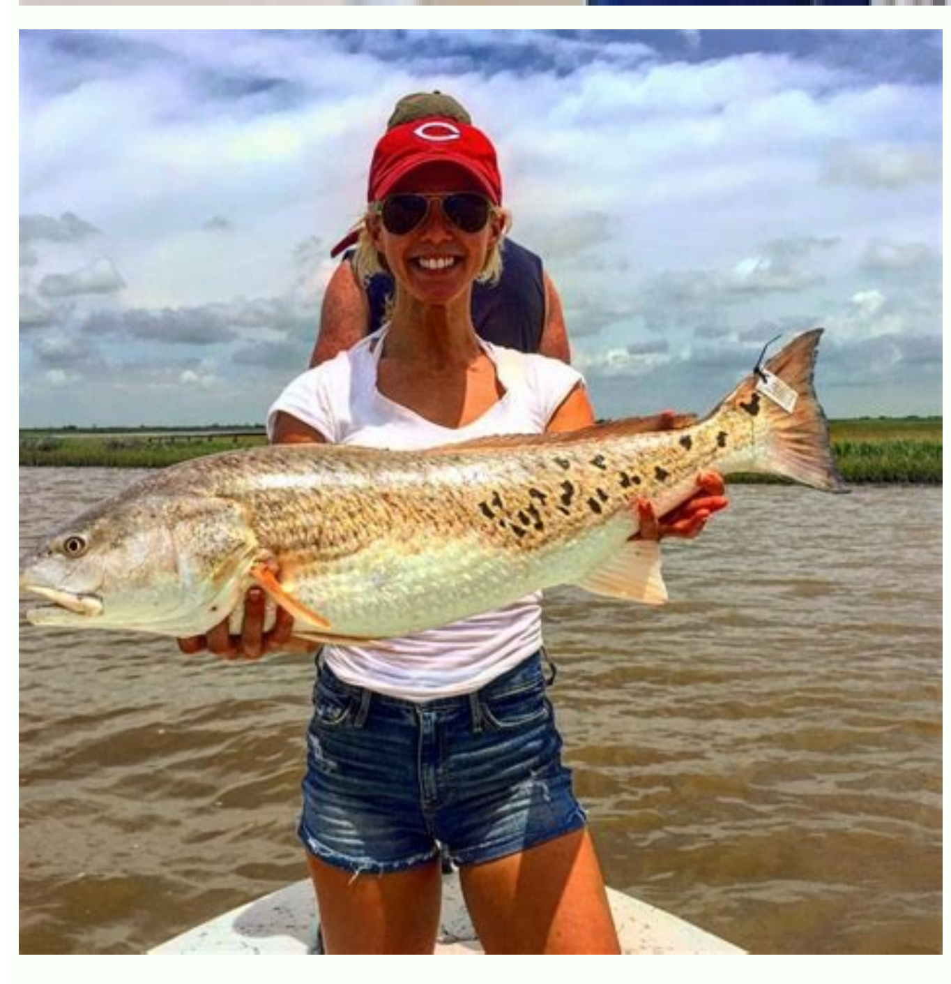
Best time to fish in freeport texas. Best fishing times freeport tx. How to surf fish in texas. Best surf fishing in texas.